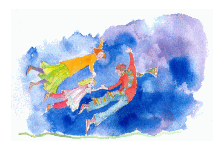
"Nothing great was ever achieved without enthusiasm." -- Ralph Waldo Emerson

Wouldn't it be ideal if we could isolate one trait in our personalities, capture it in a glass for observation and dissection? Of course this is not possible. Neither is it possible for us to isolate one part of a birth chart. The different aspects of our children's birth charts intermingle in a complex manner to make the little person that we know and love. However, it is possible for us to influence the development of our children, to support them in their journey. The aim of this section is to give vital clues for parents and mentors on how to guide, but not coerce, the development of your child.